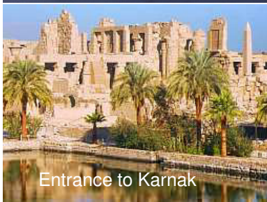
Entrance to Karnak