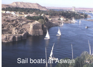
Sail boats at Aswan