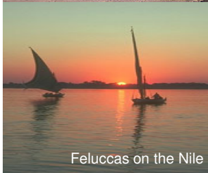
Feluccas on the Nile