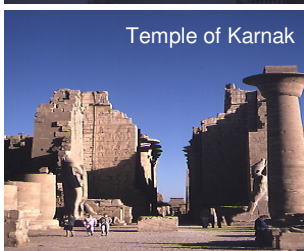
Temple of Karnak