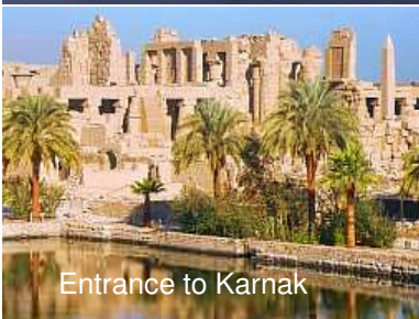
Entrance to Karnak