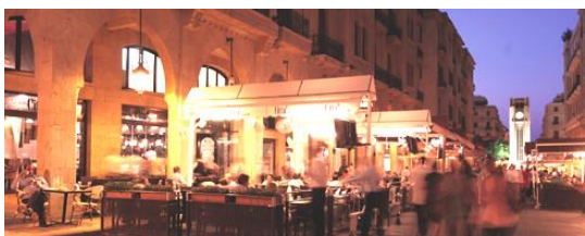
Nightlife in Beirut