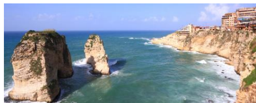
Pigeon Rocks Beirut

Day 4: Free at leisure. Transfer to airport for departure flight from Beirut to Larnaca.