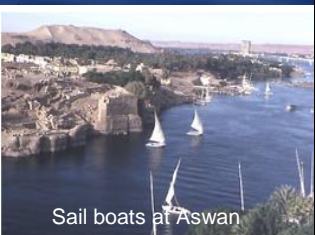
Sail boats at Aswan