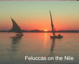
Feluccas on the Nile