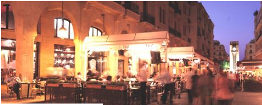
Nightlife in Beirut