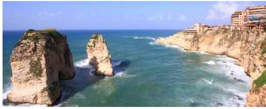
Pigeon Rocks Beirut