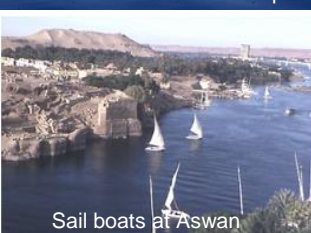
Sail boats at Aswan