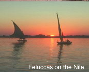
Feluccas on the Nile