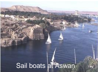
Sail boats at Aswan