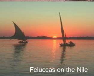
Feluccas on the Nile