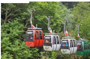
Cable car to Jeita