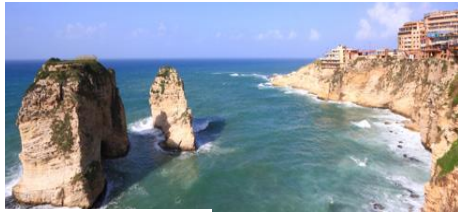
Pigeon Rocks Beirut

Day 4: Free at leisure. Transfer to airport for departure flight from Beirut to Larnaca.