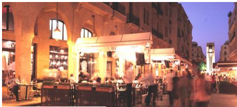
Nightlife in Beirut